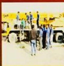
Mobile Crane Operator