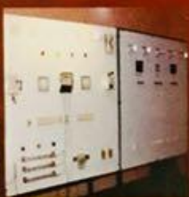
Electrical / Instrument Lab